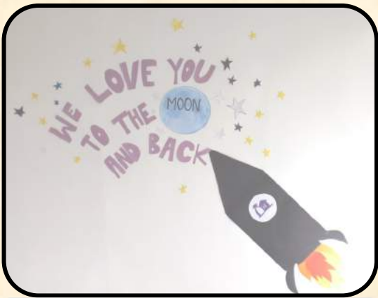
Backdrop designed by students

"A good teacher is like a candle, it consumes itself to light the way for others"