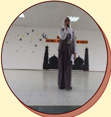
Presentation of speech on highlights of Hijri New Year

I slamic New Year also known as Arabic New Year or Hijri New Year, is the day that marks the beginning of a New