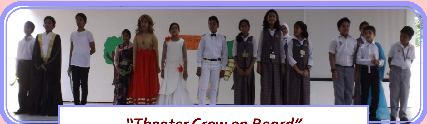
"Theater Crew on Board"