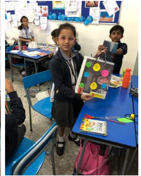
Finding Directions— Social Science Activity