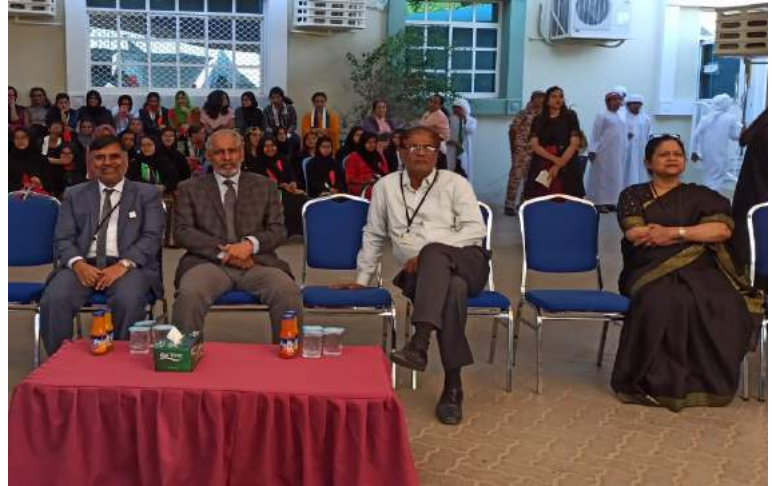
Special performance by grade 3 students in Al Ain Hospital