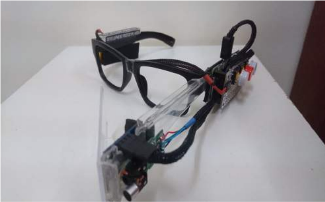
Acoustivisor—A device to assist the deaf by converting speech to sign language and displaying on a transparent display.

The Code-based open category provides an opportunity to those students who are programming enthusiasts and already developing apps for different purposes using any coding language. Students can demonstrate their ideas through any platform including, but not limited to, mobile apps, computer programs, games, web-based applications, programmed robotics, flash and multimedia applications.