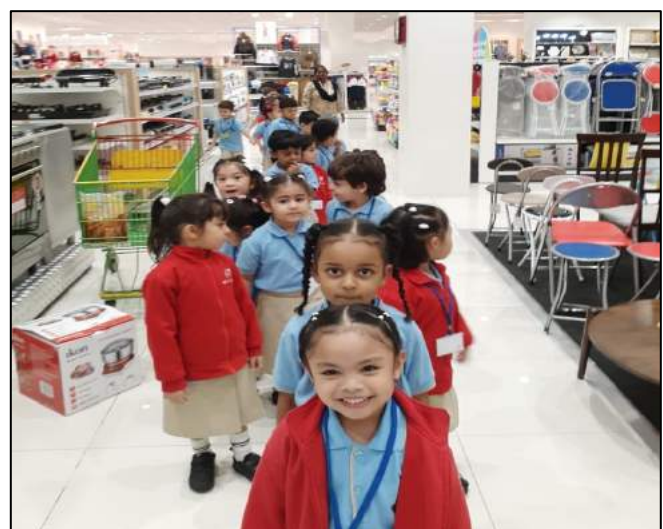
Students happily exploring the different sections of the hypermarket