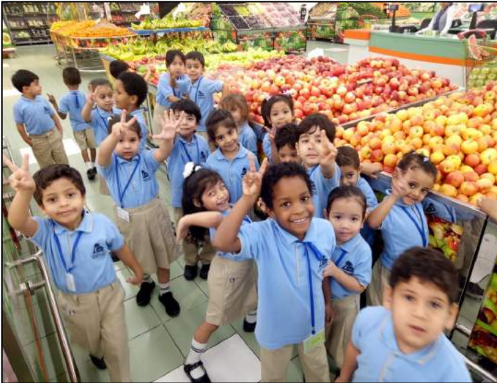
Students exploring the fruits section