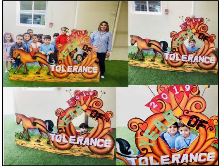
Some of the captured moments