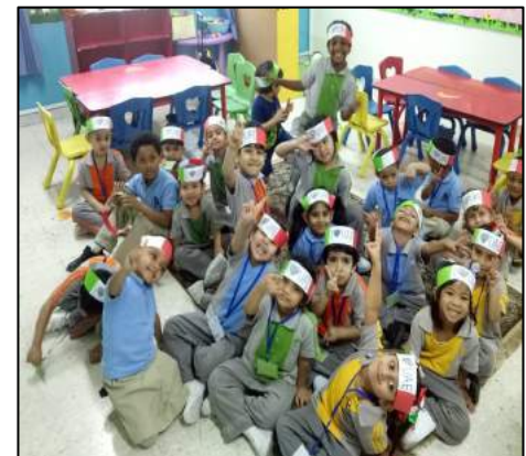
Students having a picture with their UAE Flag colour themed headdress