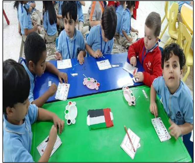
Students making the UAE Flag using different materials