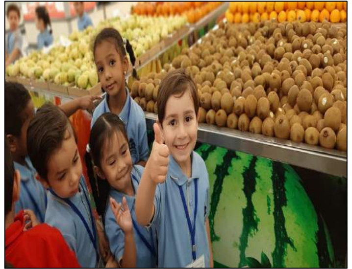
Students took a rest after exploring the hypermarket