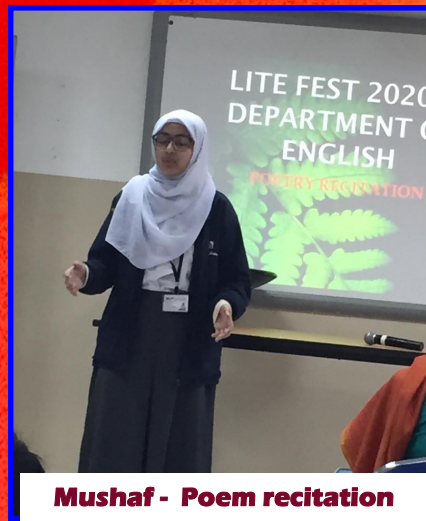
Mushaf - Poem recitation