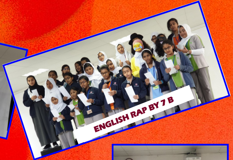
ENGLISH RAP BY 7 B