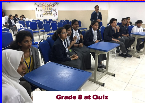
Grade 8 at Quiz