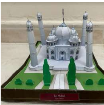
Aliya Nujum Navas 7B