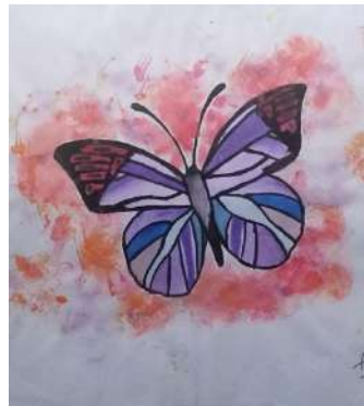
Afia Furkhan 9B