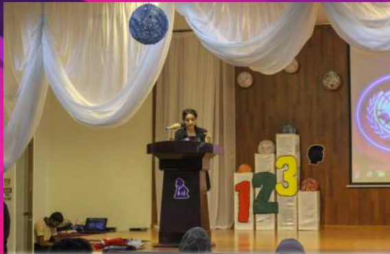
Welcome Speech given by the AJB-MUN Secretary General