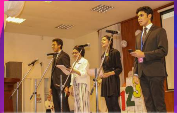
“Shots Fired” performed by the AJB Students