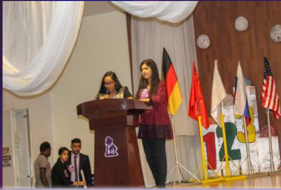
The hosts commencing the opening ceremony