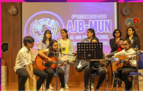
“Walking the Wire”, performed by the AJB-MUN choir