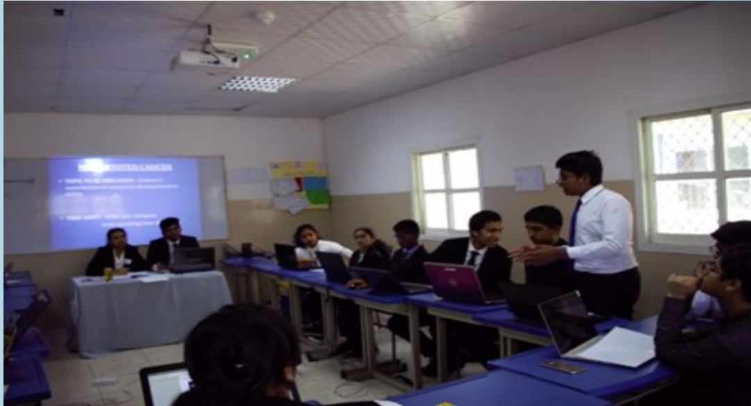
Delegate of India using his diplomacy

The 5th session of the MODEL UNITED NATIONS at Al Ain Juniors school was conducted with full pomp and show with a video presentation of AJMUN filmed, edited and compiled by students. The Al Ain Juniors Model United Nations is a platform where students collaborate and exhibit leadership skills to solve contemporary global issues. A special mention to the AJMUN Media team who compiled a video on AJMUN. The three committees in action this year were General Assembly, Food and Agricultural Organization and Social and Humanitarian Council. The delegates represented 9 countries, enthusiastically debated, negotiated and discussed with diplomacy, as they came up with solutions to the problems discussed. The chairs moderated the entire session with excellence. The MUN made sure that all ideas expressed are authenticated. It also helps build good student relationship as their ideas are incorporated together to be declared as a "Resolution".