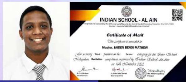
Winners of ISA Inter School Malayalam Literary Competition 2022.