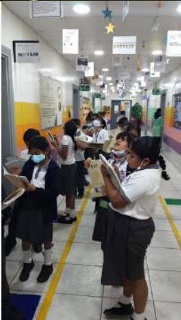
Gallery work-students getting information from softboards. Students interacting and eager to answer questions from the softboards.