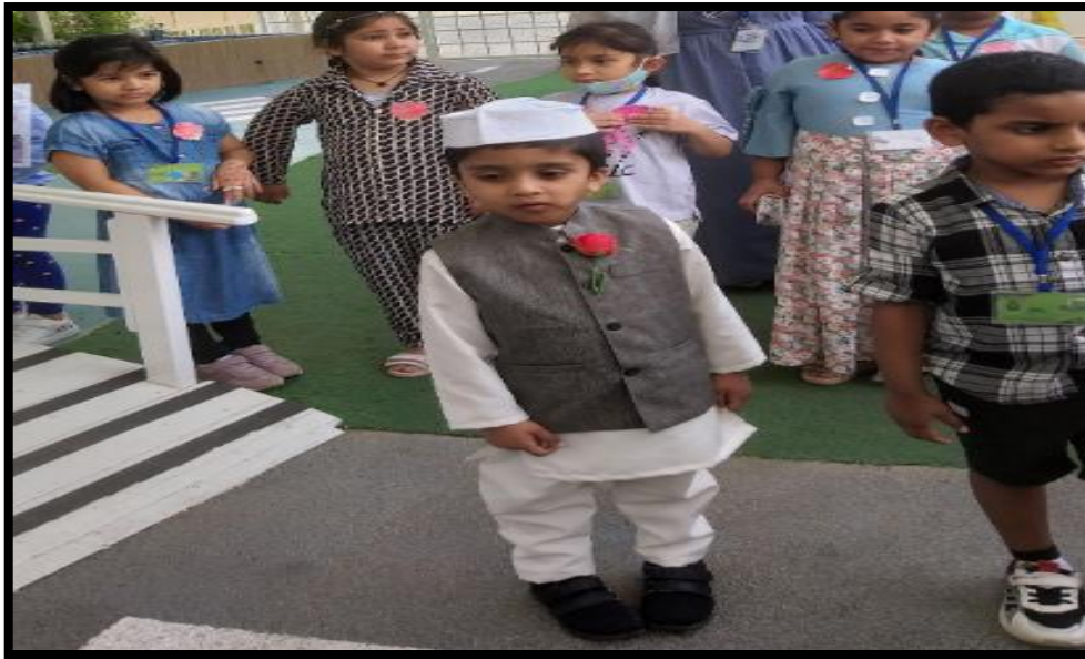
We celebrated Children's Day on November 14th , the birthday of Jawaharlal Nehru, India's first Prime Minister, who was known for his fondness for children.