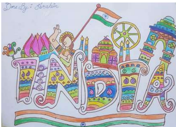
Ibrahim Firozi 7C