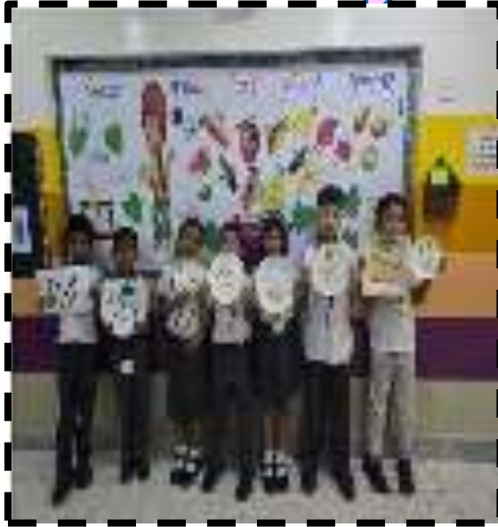
Grade 1—Fruit and Veggie face art